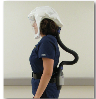
A powered air-purifying respirator