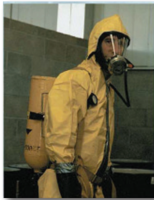
A supplied-air respirator

Further assistance on general respiratory protection in the workplace and respiratory protection resources specifically for health care providers, emergency responders, construction workers, firefighters, etc., may be obtained from the organizations listed below.